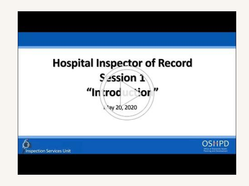
Session 1 - INTRODUCTION