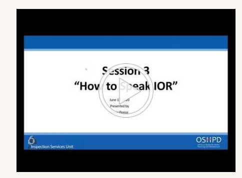
Session 3 - HOW TO SPEAK IOR