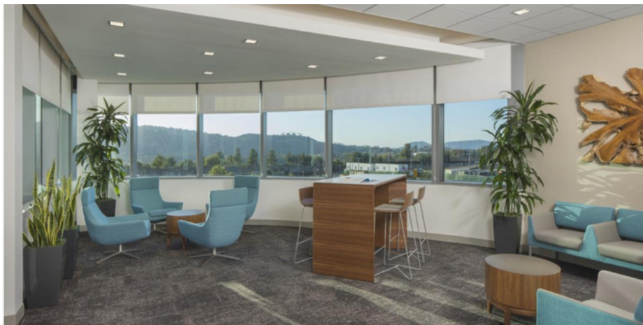
Design rendering shows a welcoming lobby area included in the expansion project at Palomar Medical Center Escondido.